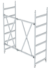
Order no.: 027971 Folding frame unit, 0.75 m