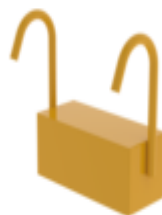
Order no.: 027912 Ballast weight