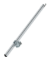
Order no.: 027920 Wall spacer adjustable