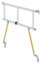
Order no.: 027992 Safety railing for mobile scaffolding