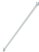
Order no.: 027937 Diagonal brace