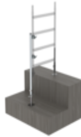
Order no.: 070506 Frame extension can be clamped on