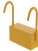
Order no.: 027912 Ballast weight