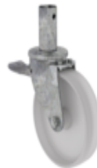
Order no.: 027958 Swivel castor