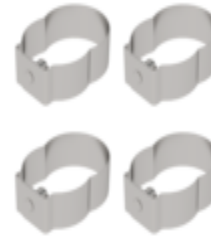
Order no.: 019136 Spring clip for mobile scaffolding