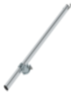
Order no.: 027920 Wall spacer adjustable