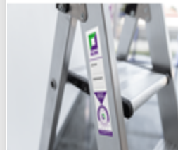
Order no.: 019176 Inventory sticker