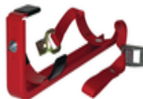
Order no.: 114997 Bracket for fire extinguisher 2 kg CO2