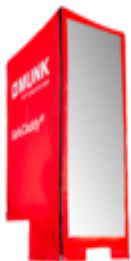
Order no.: 114999 "SafeCaddy®" tarpaulin