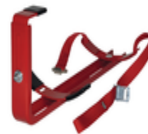
Order no.: 114995 Bracket for fire extinguisher 6 kg powder / foam