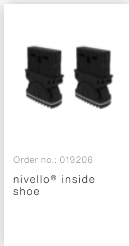
Order no.: 019206 nivello® inside shoe